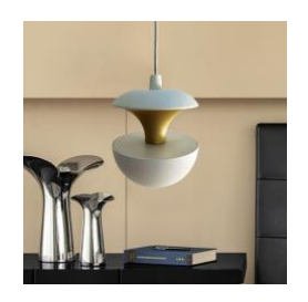
C: White with Gold

In addition to our standard colors, we offer more than 6,500 <u>finishes and colors</u> for your luminaire. We can match your paint sample or any RAL finish. Add texture and originality to create a perfect match