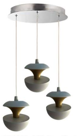
SB-P03C White Gold