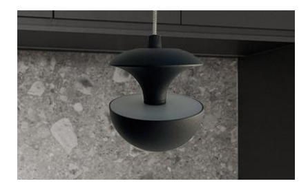
O: Black Q: Black with Gold