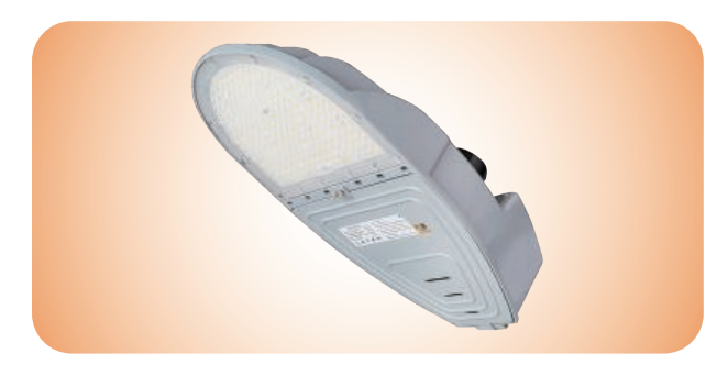
T4 STREET LIGHT