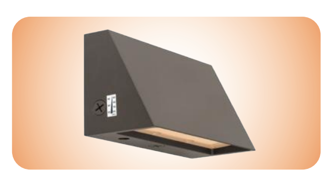
AFW I2W-30W ARCHITECTURAL WALL PACK SERIES