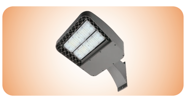
T5 AREA/PARKING LOT LIGHT