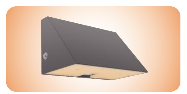
AFW 28W-I20W ARCHITECTURAL WALL PACK