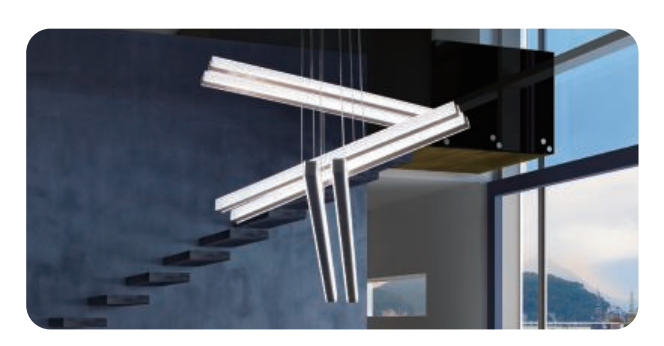
Black Diamond Linear