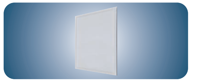
CD EDGE-LIT PANEL