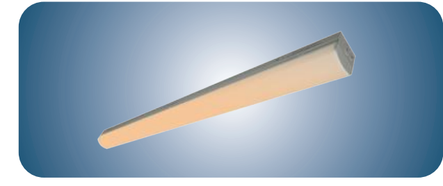
ST STRIP LIGHT