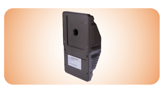
ARCHITECTURAL MINI WALL PACK