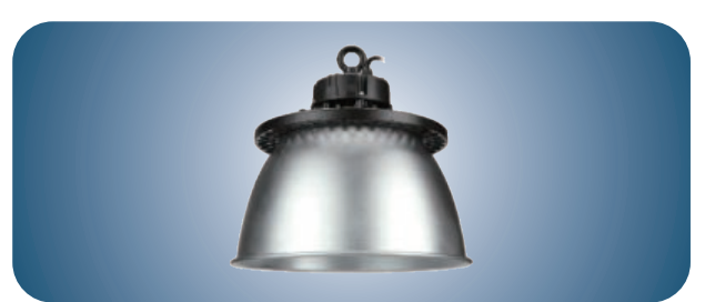
HBV HIGH BAY