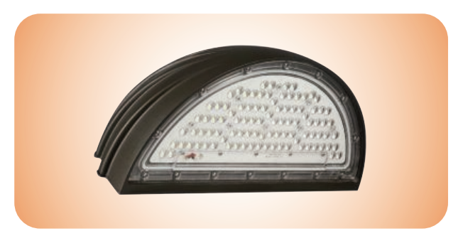
WPT HALF MOON WALL PACK