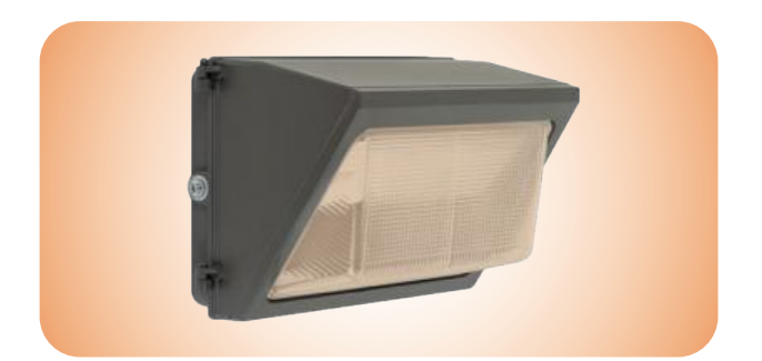
GWP LED GLASS WALL PACK LIGHT