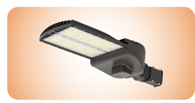
SB AREA/PARKING LOT LIGHT