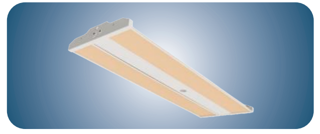
LHB LINEAR HIGH BAY