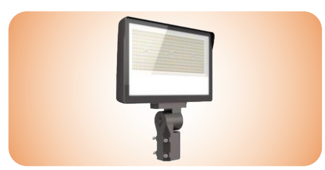
ARCHITECTURAL FL FLOOD LIGHT