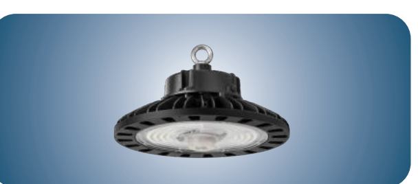
UFO HIGH BAY