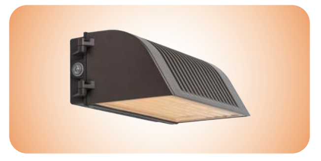
WPF FULL CUTOFF WALL PACK