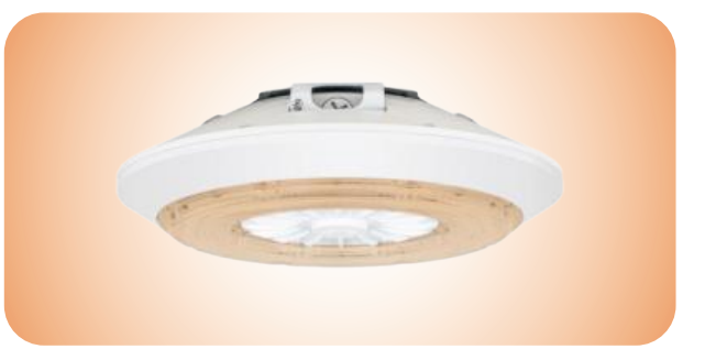
UPGC UPLIGHT CANOPY