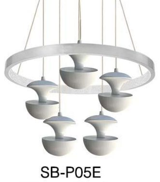
White with Ring