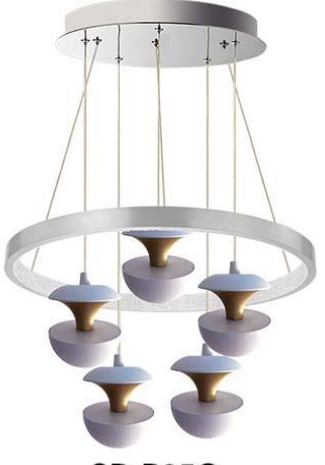
SB-P05G White Gold with Ring