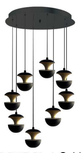
SB-P08D Black Gold